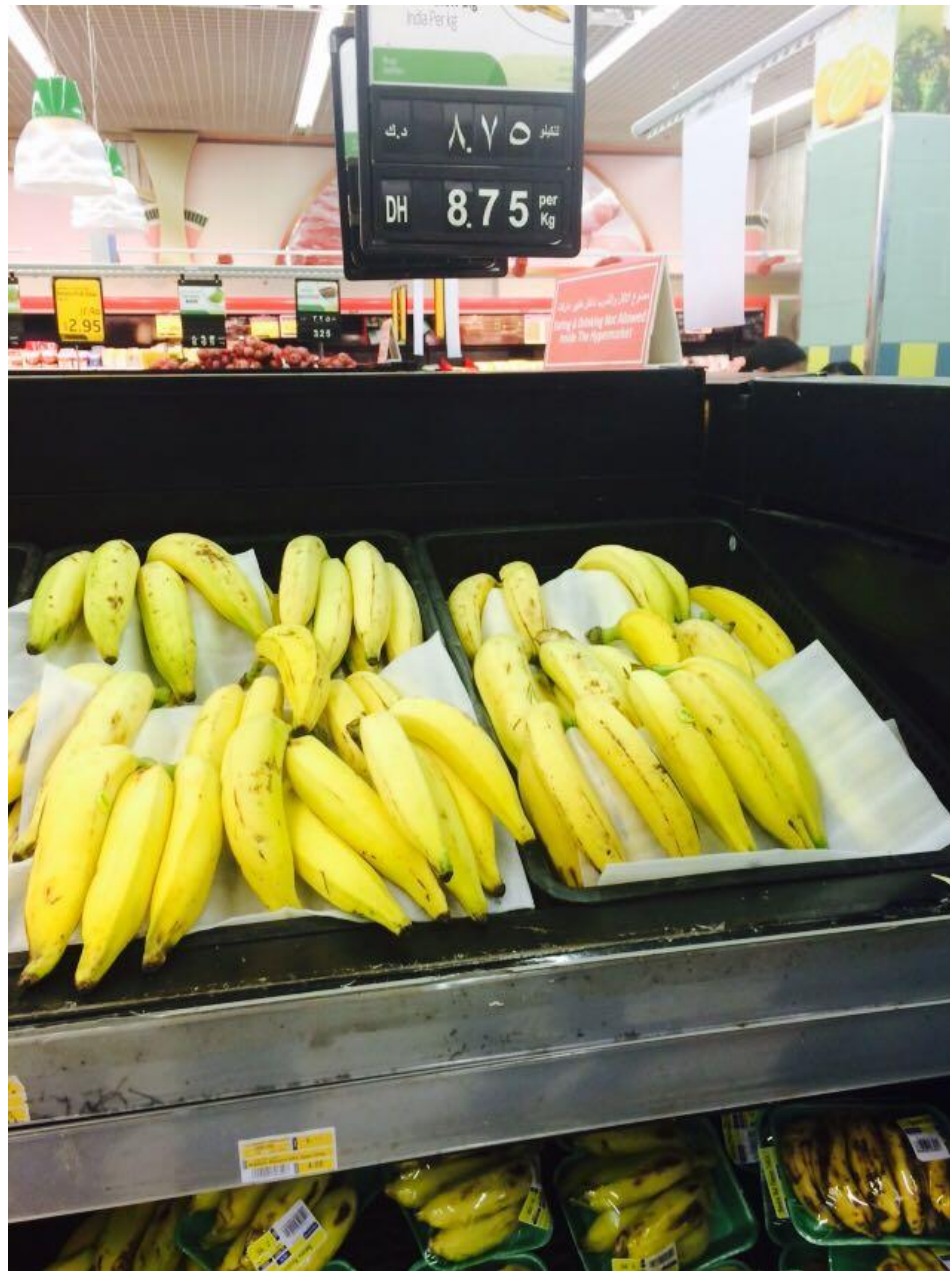
Ripe Nendran bananas in display at LuLu Mall Hyper, Dubai