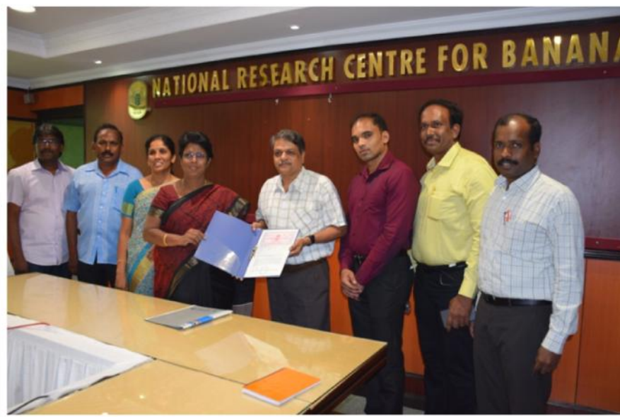
MoU with the APEDA for the Development of Sea Shipment Protocol for Nendran

After successful sailing of two consignments, Fair Export Pvt. Ltd., Angamaly, Kochi, Kerala started sailing 20 tons of 'Nendran' bananas through sea every week to Dubai with the volume of 1000 tons per year. With the saving of roughly Rs. 40,000 to 50,000 per ton compared to airlifted bananas, over all the company started realizing the savings of Rs. 4 to 5 crores per year. This cost saved could be shared with other stakeholders besides giving advantage to the consumers in the form of attractive blemish-free fruits.