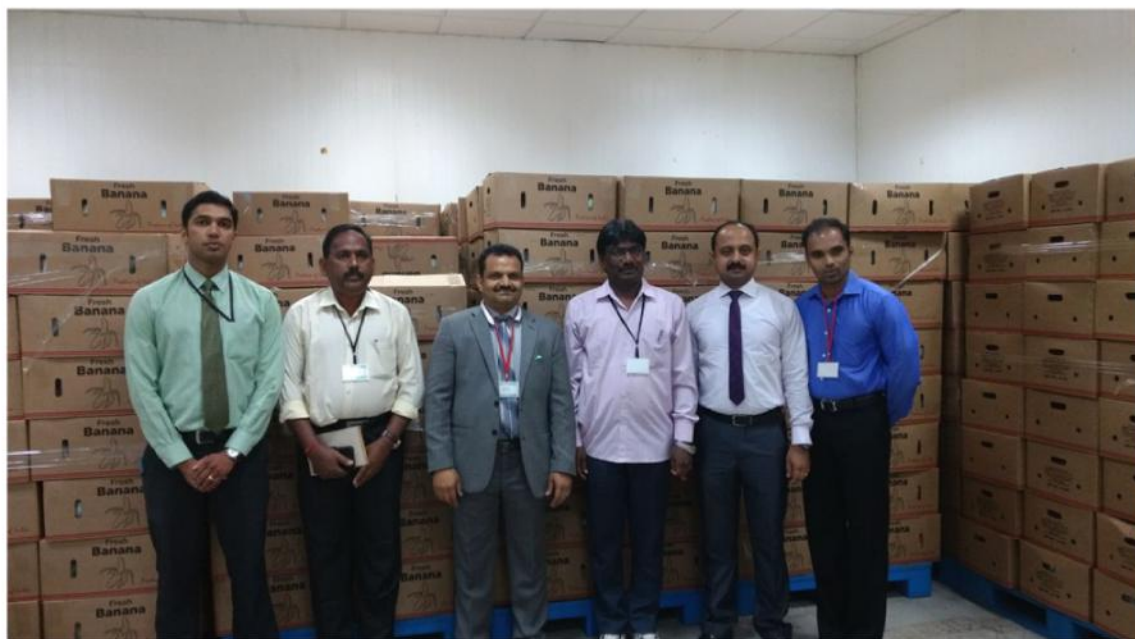
ICAR-NRCB scientists and the Fair Exports officials with the banana consignment at LuLu facility, Dubai