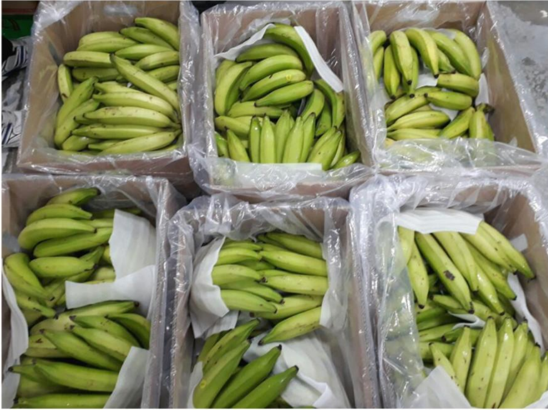
Nendran Banana sailed from the Kochi Port, India and received after 12 days at the Dubai Port